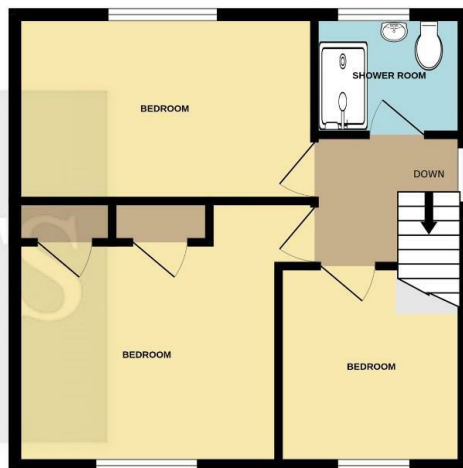
1ST FLOOR 429 sq.ft. (39.9 sq.m.) approx.