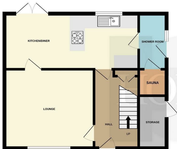
GROUND FLOOR 518 sq.ft. (48.1 sq.m.) approx.